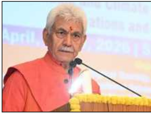
Agricultural Sciences and Technology in Jammu, and urged scientists, innovators and other stakeholders to

JAMMU, APR 28: India is leading the fight against climate challenges, with the country's agriculture production touching 357 million tonnes in 2024-25, up 25 million tonnes from 2023-24, Jammu and Kashmir Lieutenant Governor Manoj Sinha said on Tuesday. Sinha inaugurated the national summit on 'Sustainable & Climate Resilient Agroecosystems: Innovations and Policy Framework' at Sher-e-Kashmir University of